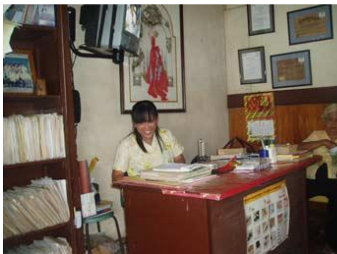
Nurse in Diabetes clinic reception

So it also is with our scheduled and planned visit to the Diabetes clinic in Ozamiz coming April 24. Not, that it will not happen to be, but that I already have been there, and I can now show an initial report of the situation for the clinic.