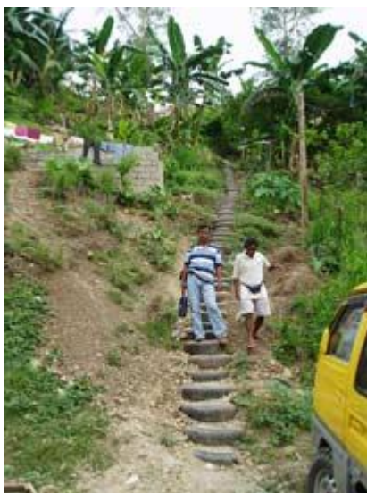
Stairway to heaven

To reach the church of Senonis, which is located in the summit of a mountain of Cagayan de Oro, can only be done through climbing a huge number of tires made as a stair, which I call “stairway to heaven”. It is really taking the breath to climb all this steps and he admitted that he have not many visitors to his church.